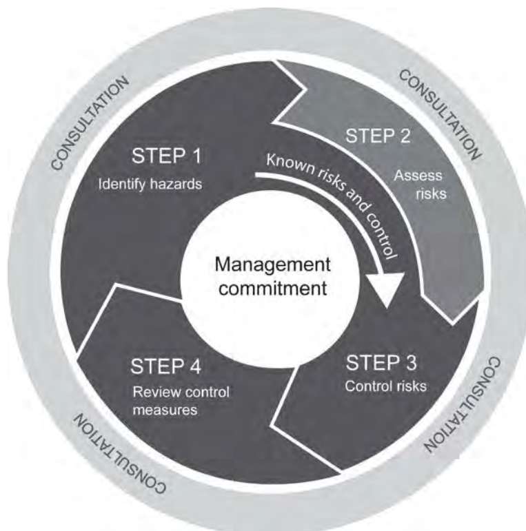
Figure 1: The risk management process