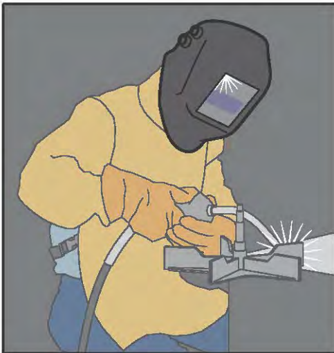
Figure 3: Welder wearing welding helmet, dry leather welding gloves and leather apron

In most cases PPE must be worn by workers when welding to supplement higher levels of controls such as ventilation systems or administrative controls (see Figure 3).